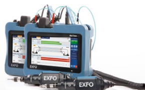
MaxTester 940 Fiber Certifier OLTS