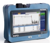
MaxTester 700B OTDR Series