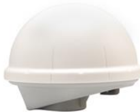
Acutime 360 Smart Antenna