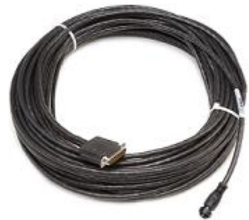
30 m (100 feet) of interface cable with DB-25 connector