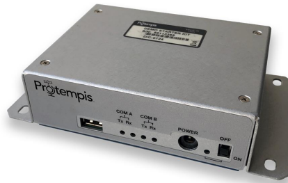
Universal Interface Module (RS-422 to USB converter)