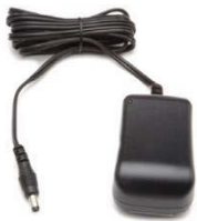
Power converter (AC to 24 VDC)