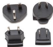
Power pin adapters